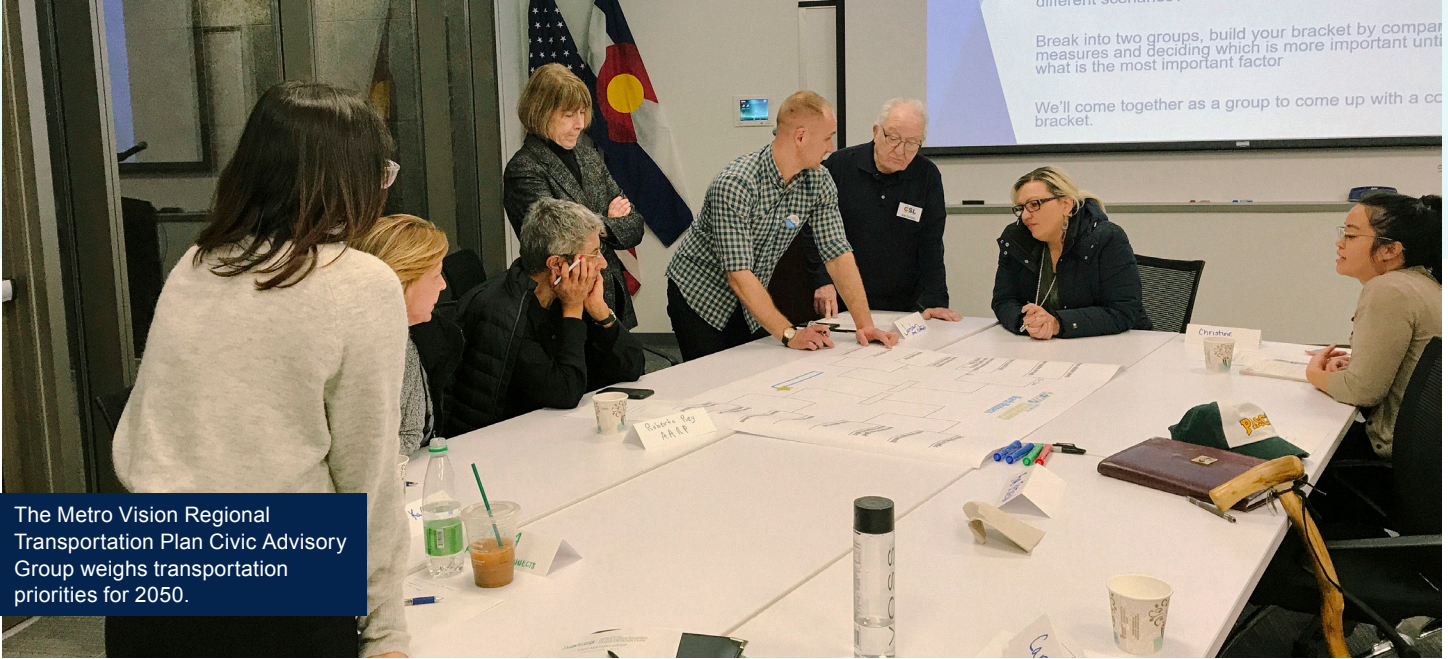
The Metro Vision Regional Transportation Plan Civic Advisory Group weighs transportation priorities for 2050.

received there, DRCOG staff began heavily promoting the survey via other means in September. Promotion began with an eblast sent to more than 2,700 people announcing the availability of the survey on Sept. 4. Several social media posts also helped to promote the survey. Almost 600 people responded to the survey before it closed on Oct. 6. A more detailed analysis of survey results and the demographics of respondents is in the Metro Vision Regional Transportation Plan Phase One Public Engagement Results document.