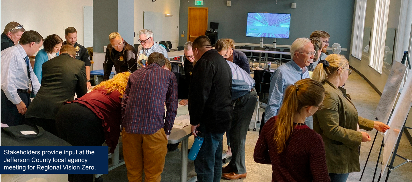
Stakeholders provide input at the Jefferson County local agency meeting for Regional Vision Zero.

the Communications and Marketing division and involved interviews with residents around the region. As of January 2020, the video had more than 650 views. The video was also included in a Twitter post on DRCOG's page, receiving nearly 1,000 views so far.