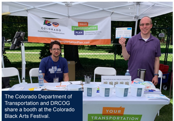
The Colorado Department of Transportation and DRCOG share a booth at the Colorado Black Arts Festival.

In 2019, DRCOG expanded its coordination with other agencies on several engagement efforts. As CDOT was updating its transportation plan this year, DRCOG staff worked closely with CDOT planners when organizing summer outreach events for MVRTP. CDOT and DRCOG shared booth space at the Colorado Black Arts Festival and Westminster Latino Festival. Staff also met with RTD to find opportunities to coordinate as the agency undertakes its Reimagine RTD initiative. DRCOG staff also had several meetings with City and County of Denver to identify efforts on which to collaborate as staff completes the Regional Vision Zero action plan and Denver implements its Vision Zero plan. DRCOG staff looks forward to continuing collaborative engagement efforts in 2020.