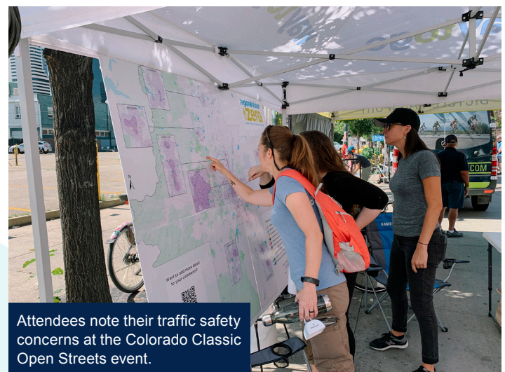
Attendees note their traffic safety concerns at the Colorado Classic Open Streets event.

To supplement online outreach, DRCOG staff attended the Colorado Classic Open Streets Event on Aug. 25. In addition to the MVRTP bucket game (see the “2050 Metro Vision Regional Transportation Plan” section), the DRCOG booth included an oversized map of the region and allowed attendees to identify traffic concerns with colored pins. Staff estimates they talked to more than 150 people at the event.