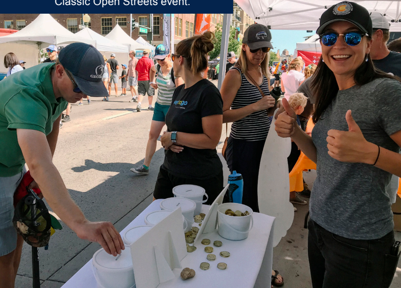
Attendees play the transportation funding game at the Colorado Classic Open Streets event.