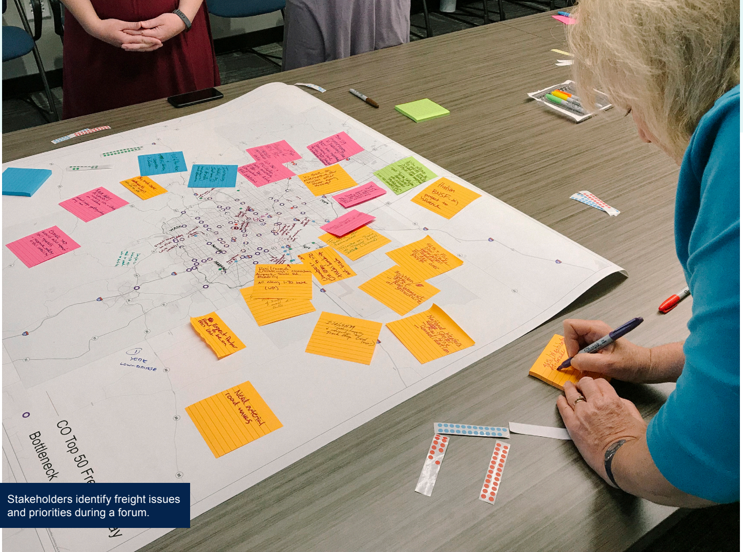
Stakeholders identify freight issues and priorities during a forum.